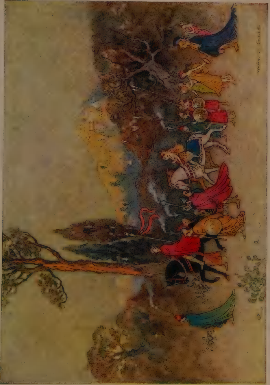
THESEUS RETURNING IN TRIUMPH